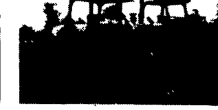
Komatsu D65E Dozer, Good U/C, New Paint, Runs Good.