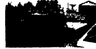
Transport 35 Ton Detachable Trailer, Pony Motor, 15" Tires, Good Condition, Non-Ground Bearing.