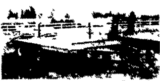
1979 General 3 Axle Tag-A-Long Trailer, 24,000 GVW, 15' Flat Ramps, 3' Beavertail.