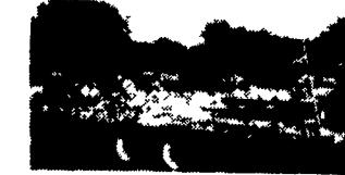
1992 New 5 Ton Tag-A-Long, All Wheel Brakes, Adjustable Hitch, Adjustable Ramps, 16' Bed.