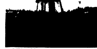
1977 Versatile 150 Bi-Directional 4WD, 3 Pt., PTO, Cab, Perkins Diesel w/Loader.