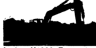
Insley H1000 Excavator, Excellent Undercarriage, GM Diesel, Runs Good, Good Bucket, Reasonable.