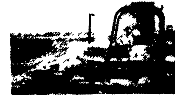
JD 350 6 Way $7,800