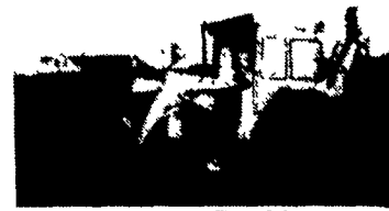
JD 310A Backhoe, w/Rebuilt Motor $11,000