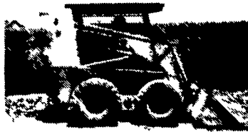
'87 Case 1845C $10,500