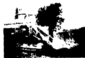
1984 JD 455D, Rebuilt Motor, New U/C $18,000

MID-ATLANTIC OXFORD, PA. AGRISYSTEMS SPECIALIZED FARM EQUIPMENT 800-222-2948