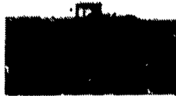
White Row Crop Cultivator are designed for high speed

With nine models, there's a model with the options to match your residue management plans.