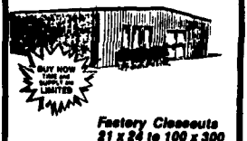
Factory Closeouts 21 x 24 to 100 x 300