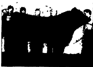
Mountain Valley Star

The ENTIRE ROCKY FORGE nationally recognized show herd SELLS!