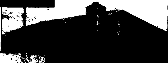
Hog Finishing Building

See Us At The DEVON HORSE SHOW May 29 - June 5