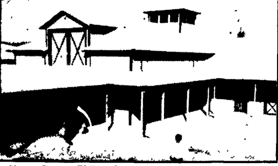
Horse Barn - Riding Arena

THE BRAND THAT MAKES THE DIFFERENCE. LESTER LESTER BUILDING SYSTEMS A Division of Duster Manufacturing Company