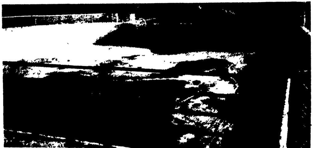
SCS Approved Manure Storage Facility

Specializing In Manure Storage Round or Rectangular In Ground or Above Ground