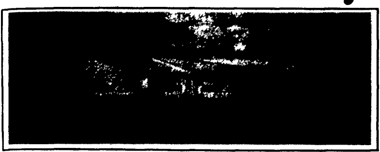
60' x 496' ASP breeder house