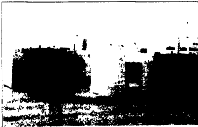
We have a variety of styles & sizes, and one to fit your home/business heating needs!