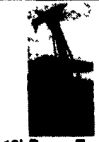
13' Boom To Fit 15-30,000 Lb. Lift $1,750