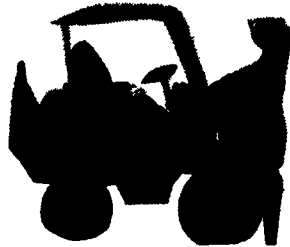
4,000 Lb. Baker All Terrain Towable Runs Good Needs Little Work $2,500