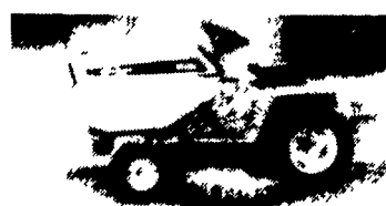
Cub Cadet 884 Lawn & Garden Tractor w/50" Mower Deck, Front Hydros & Snow Plow, Powered By 3 Cyl. Kubota Diesel Engine, Runs Excellent $3,850

Gallion 503 motor grader, Detroit diesel, cab, very good cond. $8,750 Oliver forklift w/14' mast, gas, good tires, runs & operates good CALL