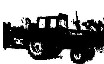
MF 1105 w/Full Cab, TA, 3 Pt, PTO, VG Tires, Low Hours, Runs & Operates V. Good $8,500

RT. 72N, Manheim, PA. 717-664-2444 717-665-2354 FAX 717-664-2835 NEW & USED Farm & Construction Equip.