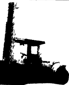
25,000 Lb. Hyster Gas 8' Forks, Very Good Cond. $17,500