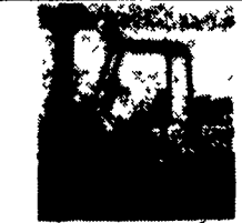
5,000 Lb. Hyster 1982 Side-Shift Very Good Cond. $6,500