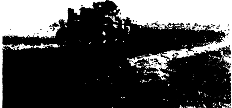
Baler's Choice is a buffered propionic acid preservative that will allow for baling up to 30% moisture without corroding equipment.

Available from: • Hooper Mill 717-768-3431 • David O. Fink 215-767-1408