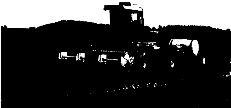
Swather's Choice is a liquid hay drying agent that will reduce curing time by one-third, soften hay stems and help retain general hay quality.

Baler's Choice Buffered Acid Preservative