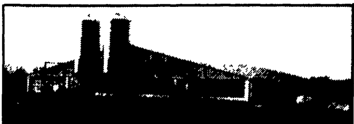
101'x245' 3000 head tunnel ventilated hog finishing house