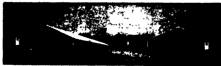
Two 50'x620' tom turkey houses