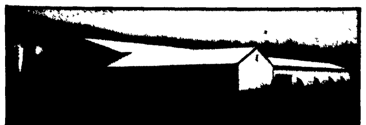
108,864 bird CHORE TIME layer house with ULTRAFLO® feeding