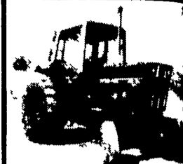
Hydra 186 Cab & Air Last Year Built With New 18.4x38 Rear Tires, 540-1000 PTO Nice!