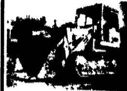
1980 Case 1450 Loader GP Bucket, 3083 Hrs.