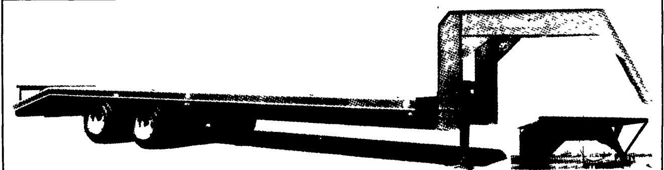
28 Foot Length Shown