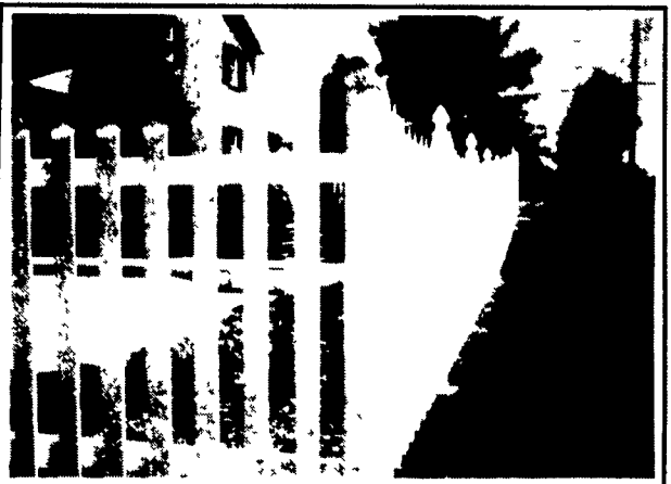
AFTER With Vinyl Fence 3" Picket With Spade Top