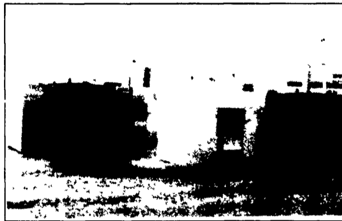
We have a variety of styles & sizes, and one to fit your home/business heating needs!