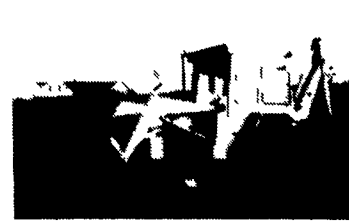
JD 310A Backhoe, 1980 $10,500