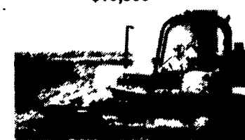
JD 350 6 Way $7,800

PARTING OUT: IH TD340 CRAWLER LOADER Case 450 Crawler Loader