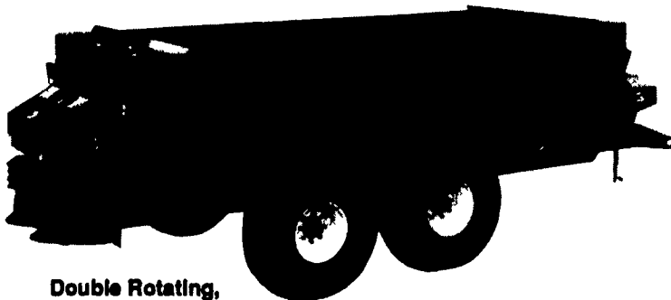
Double Rotating, Heavy Duty Expellers

Meyer Mfg. Corp. has developed a new style of manure spreader that can handle a wide variety of manure. The double expellor system rips away tough pen or frozen manure and applies it to the field in a smooth, even pattern. The new Meyer unit unloads out the rear, not the side, to prevent debris from coming back to the spreader and tractor. The Super Spreader is available in 260 bu., 325 bu., 360 bu., 390 bu., 450 bu., and 540 bu. units.