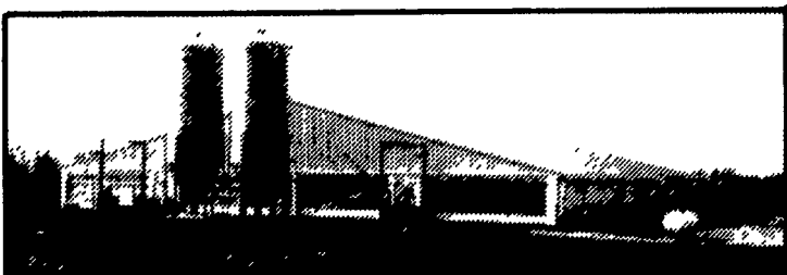
101'x245' 3000 head tunnel ventilated hog finishing house