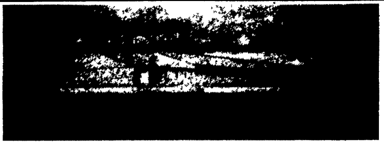
60' x 496' ASP breeder house