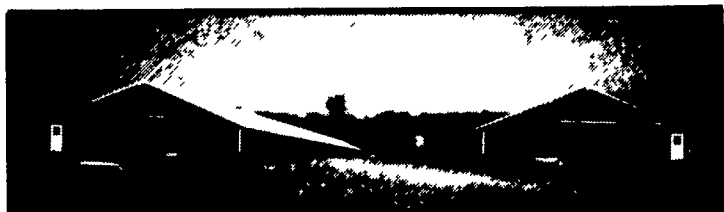
Two 50'x620' tom turkey houses