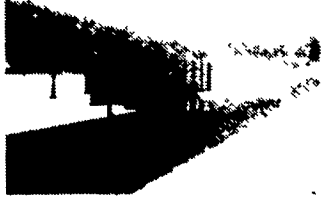
8x16' Gooseneck Dumps

Manns Choice, PA 814-623-8696 or 814-623-9696 Fax 814-623-7995