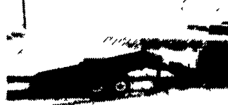
Self Contained Rollbacks On Sale Now

16 Ft. Was $6,400 NOW $4,900 18 Ft. Was $5,800 NOW $5,400