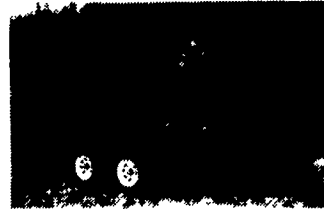
Highway Dumps All Sizes