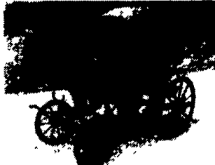
Ladies Wicker Phaeton w/Groom's Seat

Sat. - 9 A.M. - Miniature horse, dog & goat vehicles; baby carriages; flat-bed utility trailers; 1990 Wells Cargo carriage trailer, built extra high for transporting lg. coaches; 1980 horse & carriage trailer. Also several driving horses & ponies.