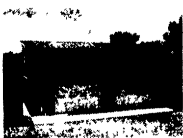
Use On Garages, Horse Barns, Etc.