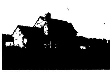
Good For All Roof Angles