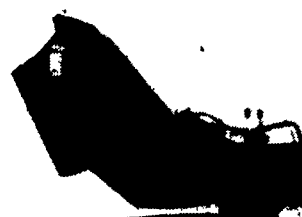
Model 3200 Hydraulic Bale Thrower