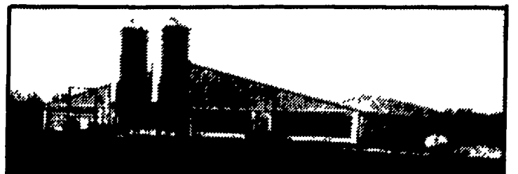
101'x245' 3000 head tunnel ventilated hog finishing house

Contracts available for • Hog finishing: 1,000-3,000 head • Sow units: 200-1,800 sows