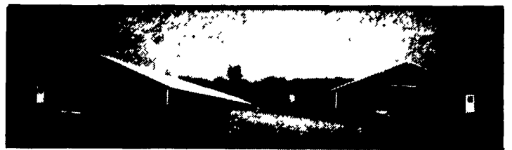
Two 50'x620' tom turkey houses

Contracts available for • Tom & hen turkeys: 7,200-15,000 birds