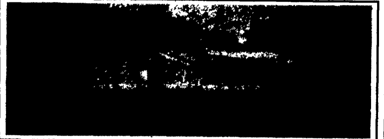
60' x 496' ASP breeder house