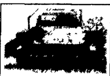
Agri-Pac New & Used Bagging Machines / Agri-Pac Silage Bags