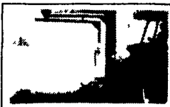
1. 3 Point Hitch Bale Wrappers 2. Bale Wrap