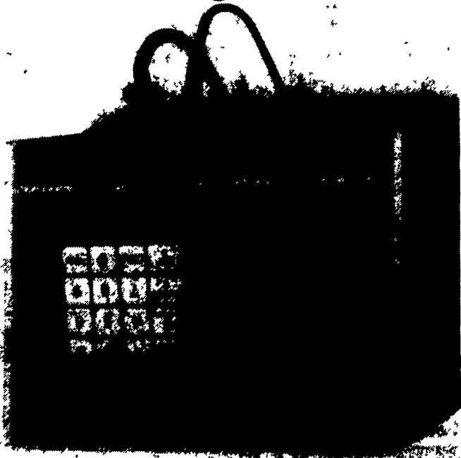
EZ320 batching electronic scale indicator designed for multiple batch weighing for livestock feeding, allows the operator to program and store a combination of 81 recipes and ingredients for multiple batching applications.

FORT ATKINSON, Wis. — J-Star Electronics, has introduced its new EZ320 batching electronic scale indicator.