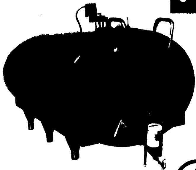
MUELLER Milk Coolers®