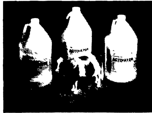
UDDERgold, 4XLA and PRE-GOLD are products of the Alcide Corporation available exclusively from American Breeders Service

For more information about Alcide teat dips call your ABS Representative or 1-800-ABS-STUD. In Canada call 1-519-669-1346.