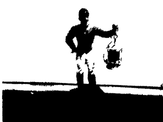
Cast Iron Jockey Lamp Post