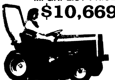
Massey-Ferguson 1010-16 HP, 4WD, Hydrostatic Transmission