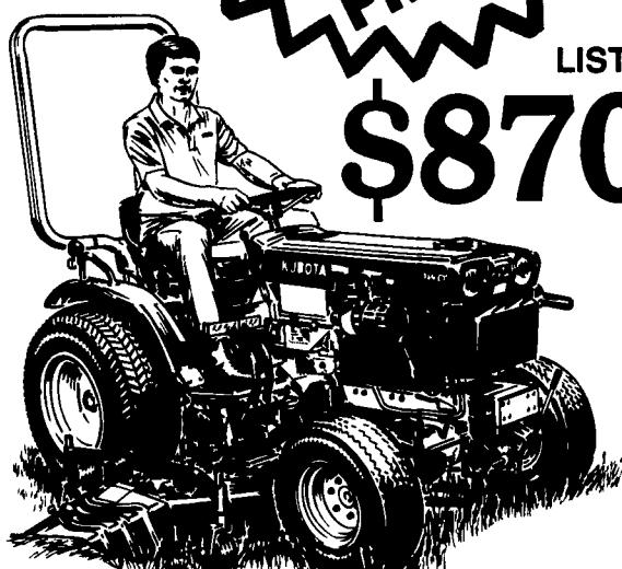
Kubota B7100 - 16 HP, Hydro. Trans, 4WD, Cat I 3 Pt. Hitch, Std. 540 PTO, Mid PTO, 3 Cyl. Famous Kubota Liquid-Cooled Diesel