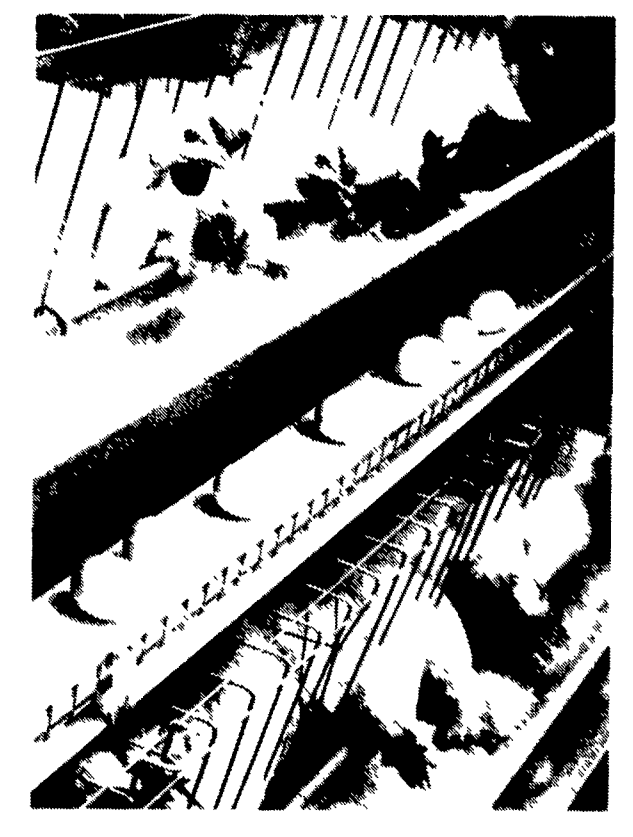
Chain reeder for Poultry Cage Systems

The Most Reliable and Efficient Feeder Available for Layer and Pullet Cage Systems.