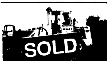
JD 544 Loader $12,500