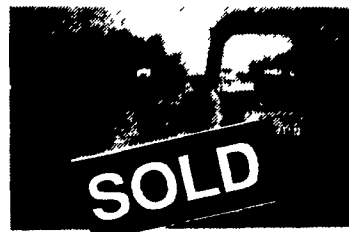
JD 450C Crawler Loader $11,500