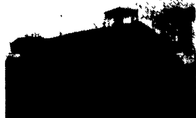
Fiat Allis 745H Wheel Loader 4 Yd. Bucket, 200 H.P., Very Good Cond. $15,000.00

JD 455G crawler loader, 1989 model, 1200 original hrs, excellent condition, $30,000 302-284-9220