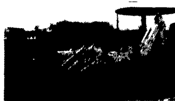
JD 450B Loader w/Backhoe and 4x1 Bucket All Condition $15,000 Tagalong Trailer $1,200