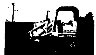
1985 J.D. 455 D Crawler Loader, New Pins, Bushings & Sprockets $18,500