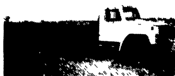
1981 Int DT466 w/Turbo, 210 HP, Motor Rebuilt, w/18' Steel Rollback w/Winch, 11 MPG $13,500