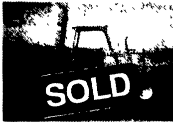
AC Rough Terrain Forklift Diesel ROPS, 6000 Lb. Capacity, 21' Mast, nice $5,500