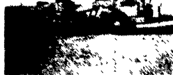
Michigan 110 Self Loading Earth Mover, Detroit Diesel, Power Shift, 23 5-25 Tires, Ready To Work $7,000

LESTER ZIMMERMAN Myerstown, PA (717) 949-3582