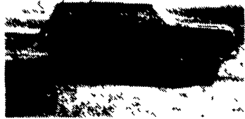
1979 Jeep Wagoneer 70,000 Original Miles, New Paint, Air, Cruise, AM-FM Cassette, Nice $3,000 OBO