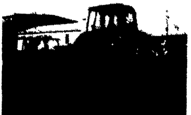
Caterpillar 922 Wheel Loader NEW 80 h.p. Gas Engine, 1 1/2 Yd. Bucket. Machine in Good Cond. $7,500.00

Heavy Equipment Loader Parts, Inc. CONSTRUCTION EQUIPMENT & PARTS SALES Rt. 22, RD 2, Box 2230, Grantville, PA 17028 717-469-0039 1-800-446-0505 FAX (717) 469-7879