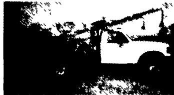
1989 Ford F-350 4x4 Diesel Truck, 7.3 Liter, 4000 Original Miles w/ Custom Mounted GVM 500 Gal. Spray Rig w/40' Booms and Foam Markers, Like New Only $28,500