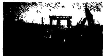
JD 310A 1981 Cab, Low Hours, New Rear Tires, Nice $10,500