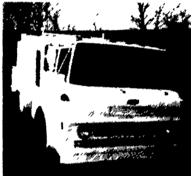
1979 Utility Truck V8, Auto, 23,000 GVW, 45,000 Miles, Ready To Go To Work.