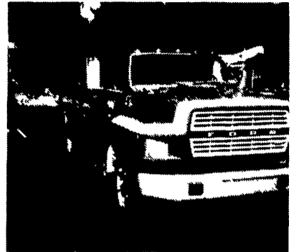
Dump Truck One of several - 1981 Ford F-600, gas, auto. We also have five man cabs with dumps and air compressors