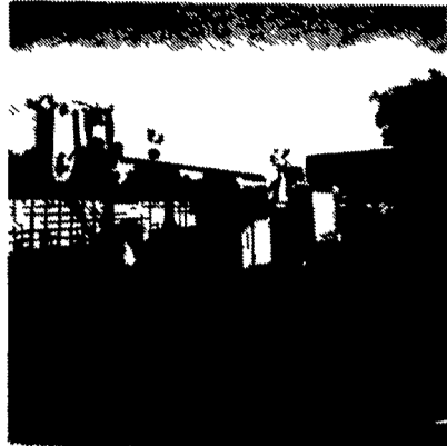
20 Ton P&H Crane 3 Sec. Hyd. Boom mounted on a 1968 F.W.D. both engine gas (new front 89), fleet maintenance.