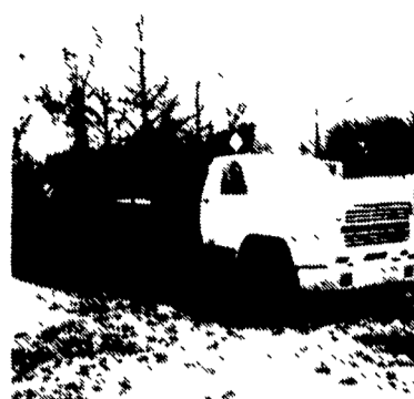
Knuckboom Truck Ford 1980 8.2 Diesel, Flat Bed, Work Ready To Go.