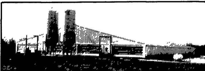
101'x245' 3000 head tunnel ventilated hog finishing house

Contracts available for • Hog finishing: 1,000-3,000 head • Sow units: 200-1,800 sows