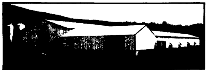
108,864 bird CHORE-TIME layer house with ULTRAFLO® feeding

Contracts available for • Layer houses: 90,000-126,000 birds