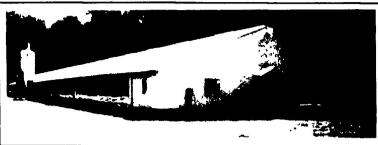
42' x 328' breeder house