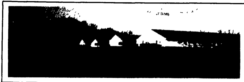
1200 SOW COMPLEX