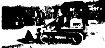
Case 855C C/L w/ROPS Canopy, GP Bucket, VG U/C, Runs & Operates V.G. $18,500