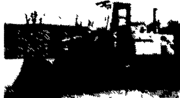
1983 Dresser/Int. 515B 4WD Art. Wheel Loader w/Full Cab, GP Bucket 3rd Valve, Runs & Operates Like New $22,500