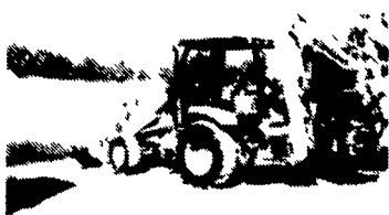
Case 580K TLB w/ROPS Canopy, Standard Hoe 4N1 Bucket, Runs & Operates Like New $25,000