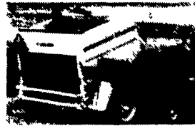
Model 484 with optional bale slicer

Others include round balers, disc mowers, sickle mowers and mower conditioners, rakes and hay handling equipment.