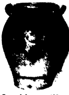
One of Approx. 100 Decorated Stoneware & Crocks (Most With Blue Designs)