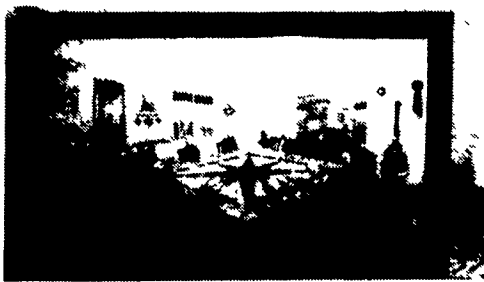
3-D Wood Carving "Quilting Bee" By Aaron Zook

Location: New Hope Eagle Fire Co., New Hope, PA On Route 202, approx. 30 miles North east of Willow Grove Exit of the Pennsylvania Turnpike.