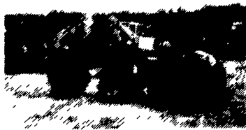
MF 285 w/Loader, 3 Pt. Hitch, PTO, Aux. Hydro, Runs & Operates Very Good $10,500