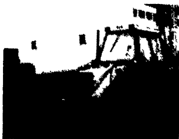
1987 JCB 1550B 4WD TLB w/Full Cab Standard Hoe, Low Hours, Runs & Operates Excellent $19,500