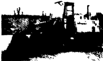
1983 Dresser/Int. 515B 4WD Art. Wheel Loader w/Full Cab, GP Bucket 3rd Valve, Runs & Operates Like New $22,500

717-664-2444 717-665-2354 FAX 717-664-2835 NEW & USED Farm & Construction Equip.