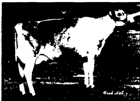
GLENWOOD Daughter JDM Duncan Duke Leora Burke Jersey Farm, Marionville, MO

G LLENWOOD (29 J2910) added 25 new daughters this summary and continues to be the #1 MFP$ bull of the breed. A Duncan son out of a TOP BRASS, GLENWOOD combines exceptional production along with type. Early data shows GLENWOOD daughters to be tall and dairy with snugly attached udders and correct teat placement.