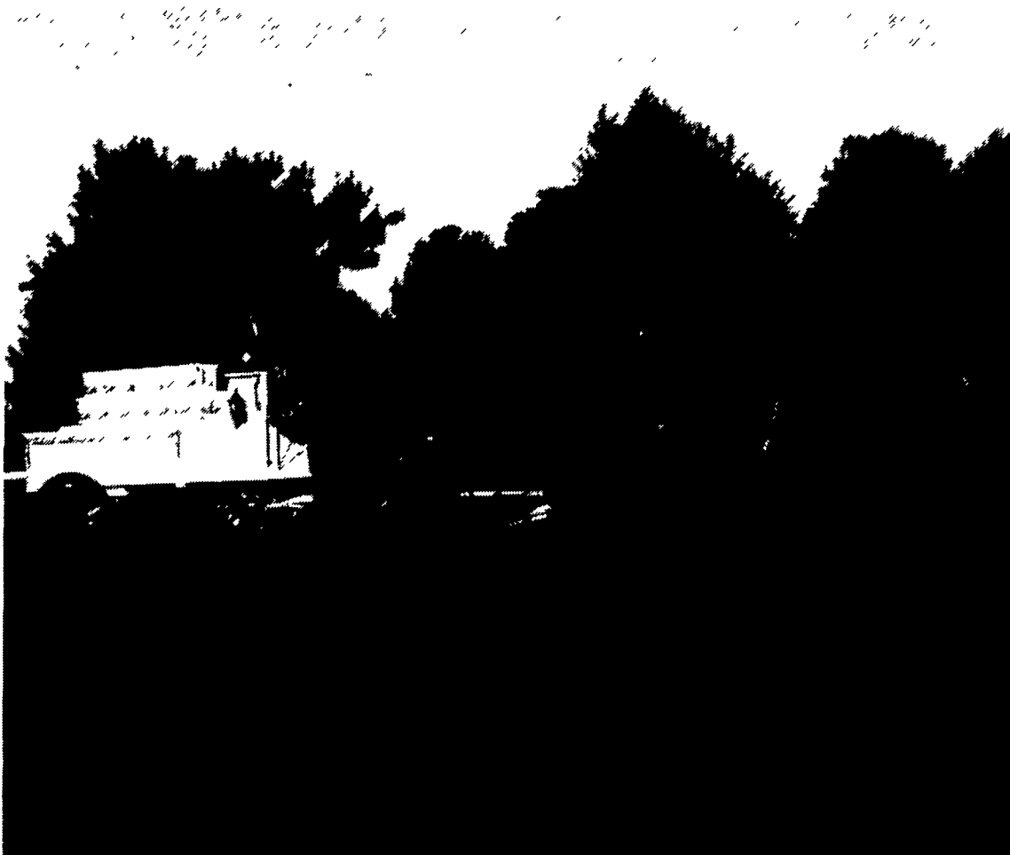
Weighing close to one ton, the Pennwoods Farm Percheron draft horses stand a majestic six feet high. John Cole, owner, prepares them for qualifying shows that lead to the Classics Series.

On the qualifying show circuit, Cole transports their team of six or eight horses, plus an extra, to eight major shows, including the Keystone International Livestock Exhibition (KILE) in Harrisburg, where 400-500 horses compete.