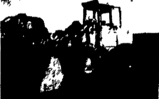
Flat 940 Rubber Tired Loader, New Paint, Cab, Runs Good, 1976, 1 1/2' Yard.