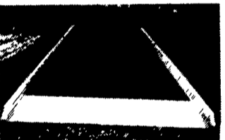
Portable Ramp, 9'6" Wide, 36' Long, 25,000 Lb. Capacity, Good Condition, Dolly Wheels, New Cost $16,000.