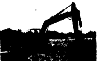
Insley H1000 Excavator, Excellent Undercarriage, GM Diesel, Runs Good, Good Bucket, Reasonable.