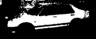
Volkswagon Jetta's 85 GL Turbo Diesel