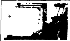
1. 3 Point Hitch Bale Wrappers 2. Bale Wrap