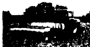
New 6000 Planter two bar design features interplant row units

and wide array of attachments allow you to plant in nearly any field condition—no-till, mulch till, or finely worked—with row widths ranging from 15" to 40".