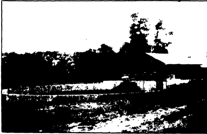
Partial In-Ground Tank Featuring Commercial Chain Link Fence (5' High - SCS Approved)