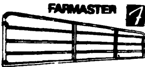
"STOCK GUARD" TUBULAR 1 1/2" ROUND CORNER GALVANIZED CATTLE GATES