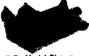
7 Ft. Model Shown

The King Kutter Rotary Mower is a leader in performance and quality. It is constructed with a single top sheet welded to heavy I-beams and reinforced with spider and cross bracing for long lasting, heavy-duty performance.