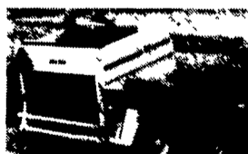
Model 484 with optional bale slicer

Others include round balers, disc mowers, sickle mowers and mower conditioners, rakes and hay handling equipment.