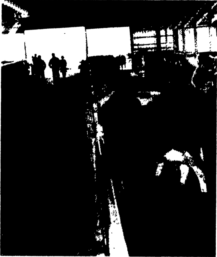
This freestall is apparently being used the way it was intended: cows are either eating, or lying down to chew cud; not standing in the aisles. The Hersheys used 300 pounds of shredded rubber bedding for each stall, covered by a heavy tarp, to provide cow comfort.

help them manage and keep track of the farm operation. (Turn to Page A35)