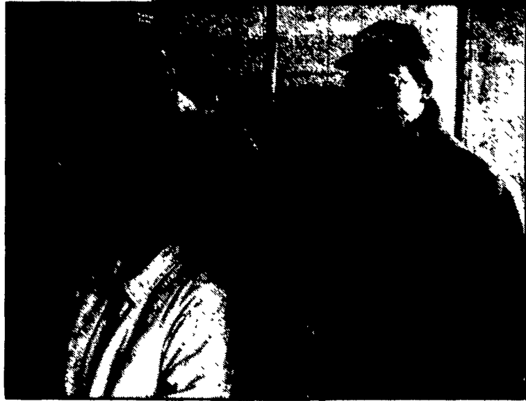
Moore Farm Chester Co., PA