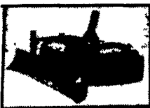
3 POINT SCRAPER